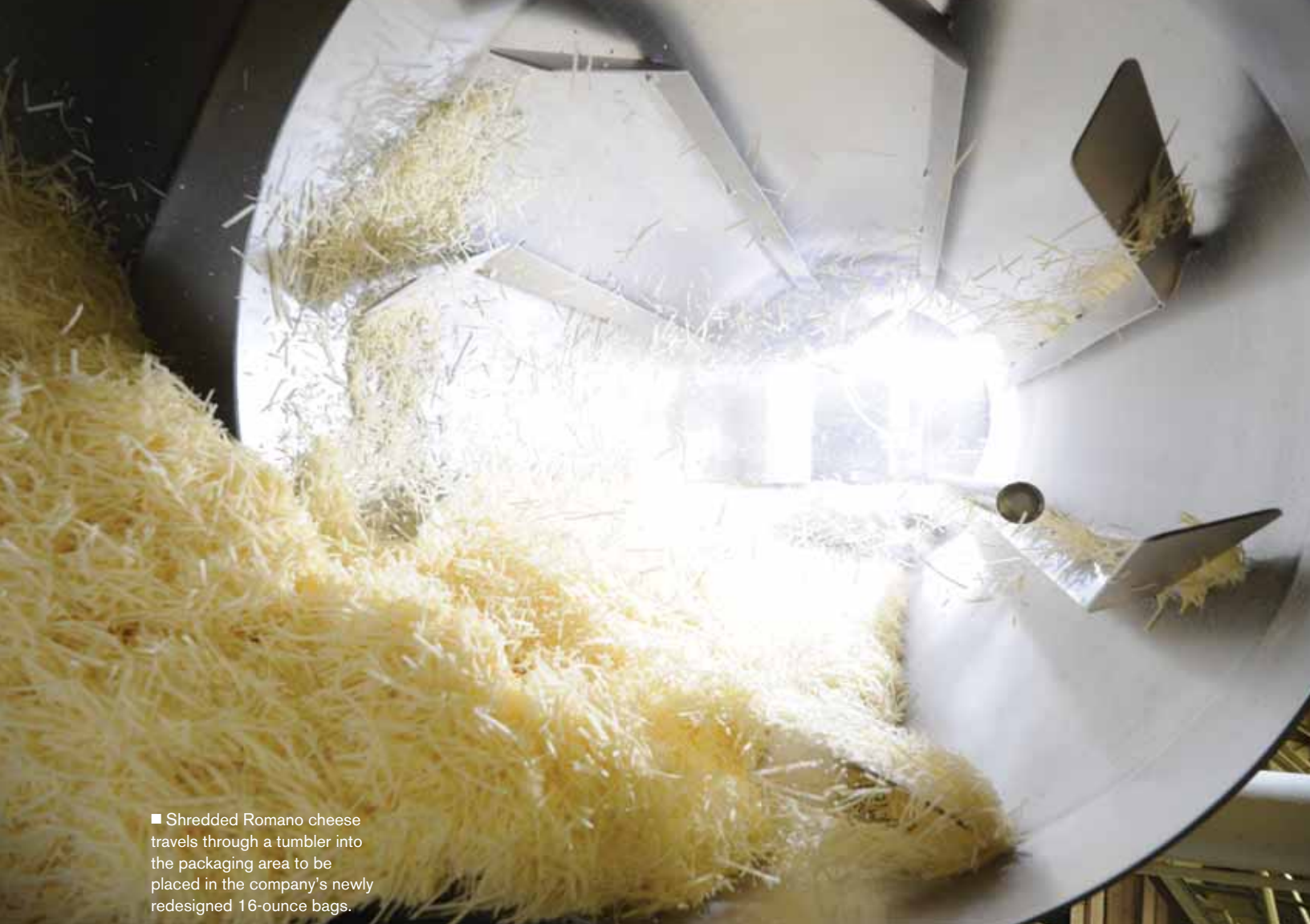
■ Shredded Romano cheese travels through a tumbler into the packaging area to be placed in the company's newly redesigned 16-ounce bags.