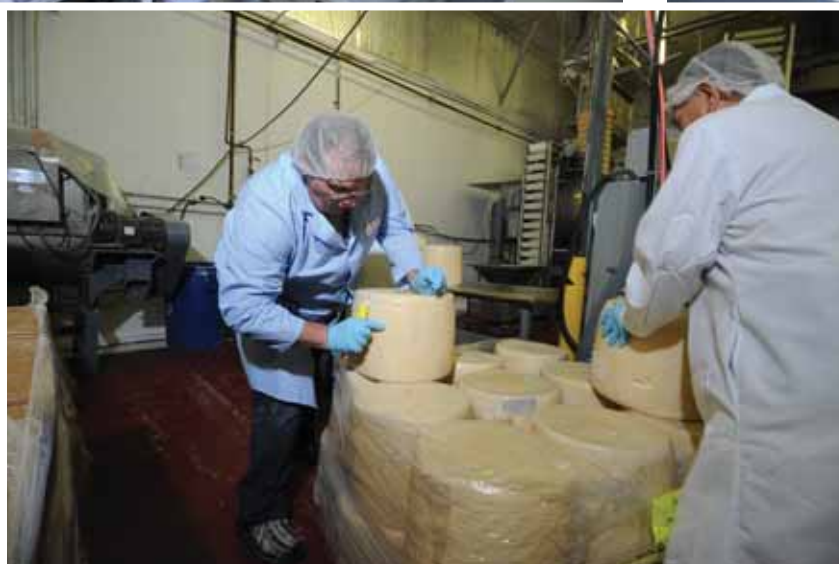
■ Top left: After being chopped, a conveyor lift moves product into the vibratory conveyor, which travels into the packaging area. Left: Cheese comes in from various domestic and imported suppliers in wheel forms (in a multitude of sizes), which are sliced in halves and then sent through a bowl chopper. Above: While in the chopper, which holds 500 pounds of mix, operators add an anti-caking blend to protect the product.

chopper, which holds 500 pounds of mix, operators add an anti-caking blend to protect the product.