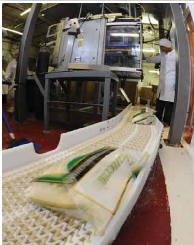
■ Left: Milano's pumps out close to 400,000 pounds of grated, shredded and shaved Parmesan, Romano and Asiago cheeses from its 75,000-square-foot facility in Linden, N.J. Above: A sheeter pushes the cheese up to a bucket elevator and into the 50-foot zig-zagged vibratory conveyor that aligns the ceiling.

it passed the Silliker Good Manufacturing Practices audit, and just one month later, received approval for food establishment for the U.S. Military Armed Forces Procurement. Then, in October 2010, Milano's received SQF 2000, Level 2 certification and is vying to obtain Level 3 in the fall. The plant also underwent HACCP certification.