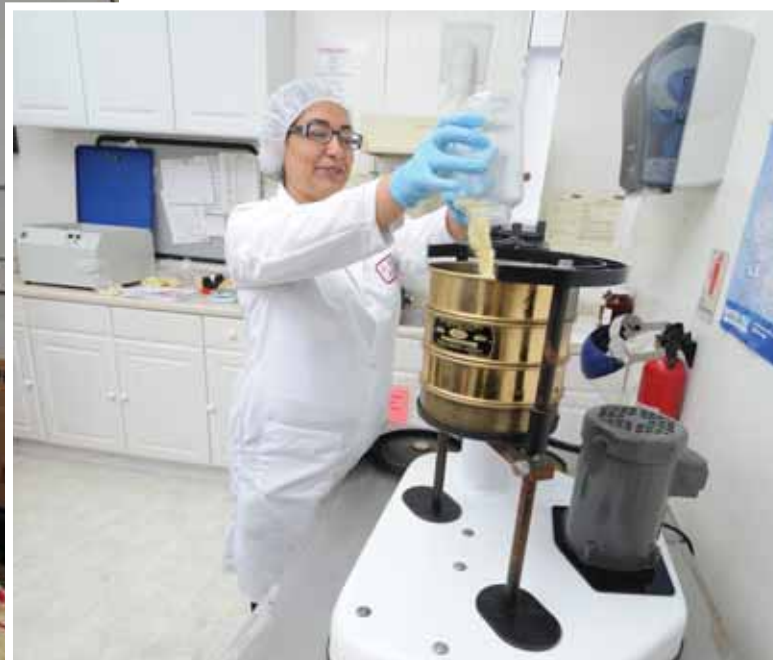
■ Left: Milano's developed a 1-pound economy-size pillowpack bag featuring a zipper seal that was designed to give consumers more product for less money. Above: Milano's conducts monthly environmental swabs and a weekly aerobic plate count to test for micro-organisms and spoilage.

casepacker before being manually palletized and shipped out through one of the company's four docking stations.